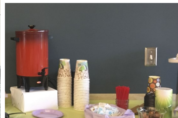
Our "Zen Study Break included a variety of healthy snacks