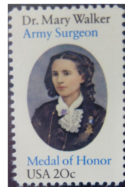
A US Postage stamp from 1982 honoring Dr. Mary Walker, the first female army surgeon.

There are no spots left in August, but you can pre-register for access during the entire month of September by e-mailing training@siumed.edu