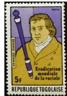
Stamp celebrating Edward Jenner and the eradication of smallpox