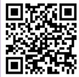
SIUSM Library Mobile Site