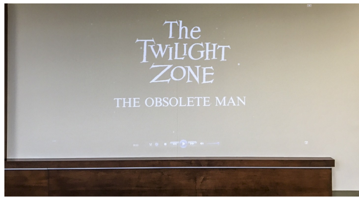
Halloween in the lobby: a Twilight Zone episode in which a Librarian is told he is obsolete and will be terminated.

Phone: 217-545-2658 E-mail: reference@siumed.edu